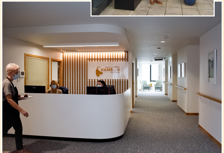
The Inpatient Unit